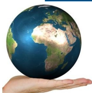
DEVELOPMENT (Page 4)