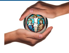
CST (Page 6)

We welcome your inclusion and participation in our 'call to action'.