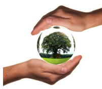
ECOLOGY (Page 3 & 4)