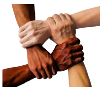
JUSTICE (Page 2 & 3)

The JEDO mission is to service God for justice, peace & ecology